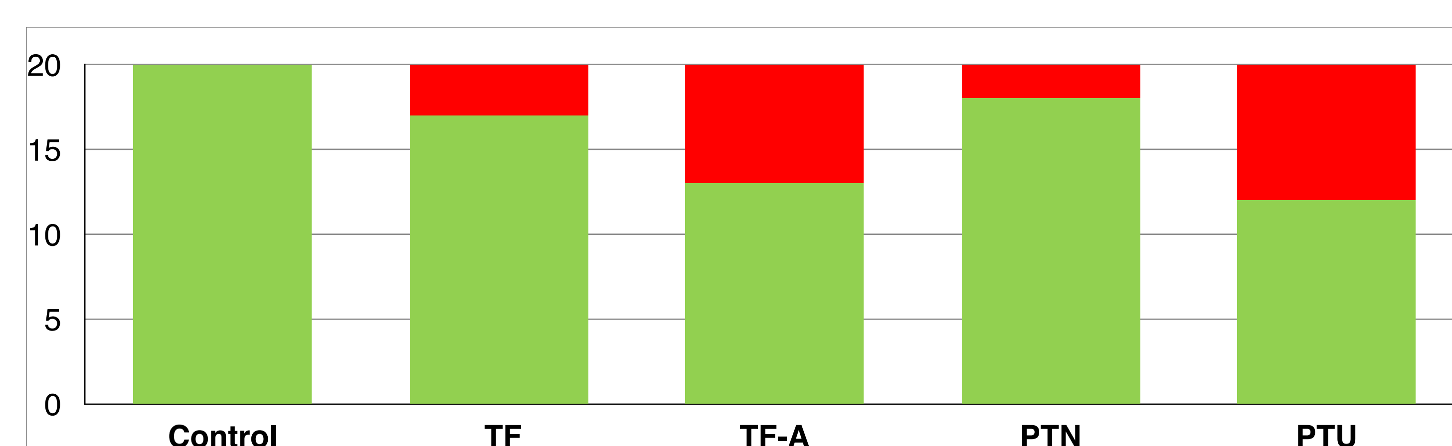
Figure: Number of observed infraction defects (red) in the different groups (n=20), no infractions (green).